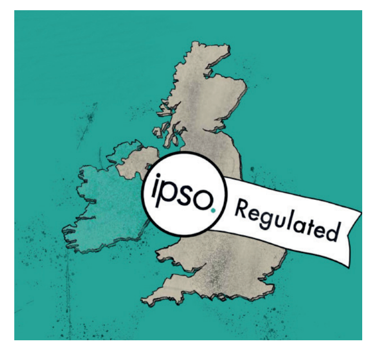
Above: The IPSO Mark in 2018's national advertising campaign

Launched in 2018 with a nationwide advertising campaign, the IPSO Mark is a visual symbol that publishers are regulated and accountable.