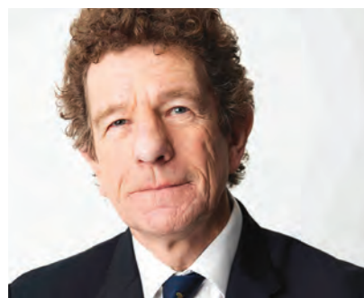
Lord Edward Faulks Chairman of the Board

IPSO's Complaints Committee rules on potential breaches of the Code and decides what a newspaper or magazine should do if the Code has been breached. The majority have no connection with the industry. Industry members are not currently serving editors.