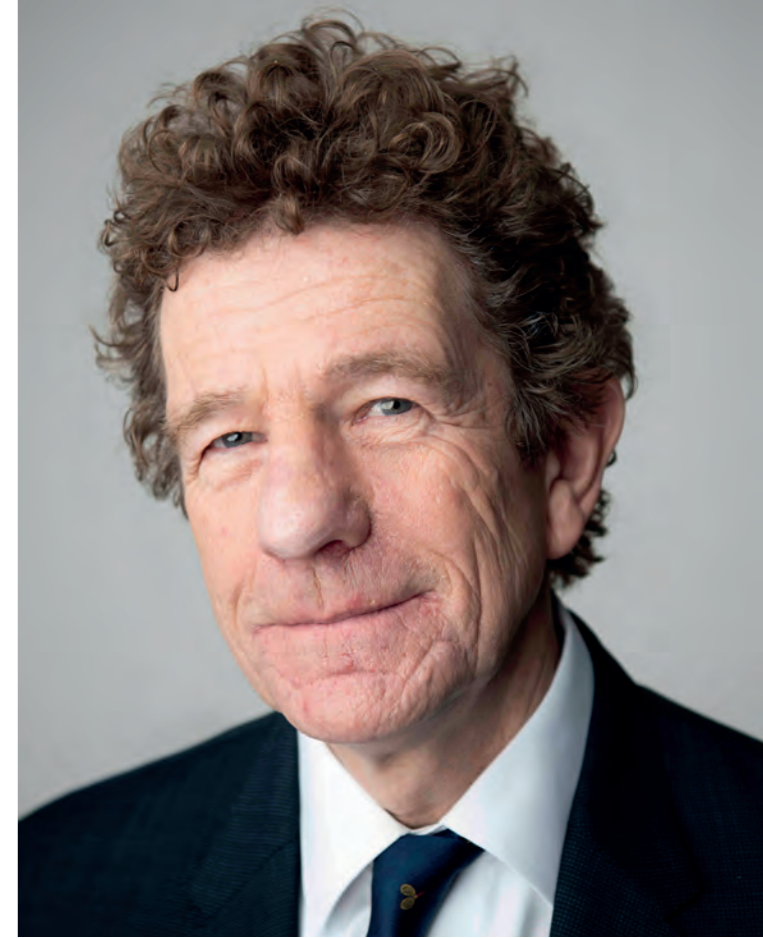
IPSO Chair Lord Faulks KC