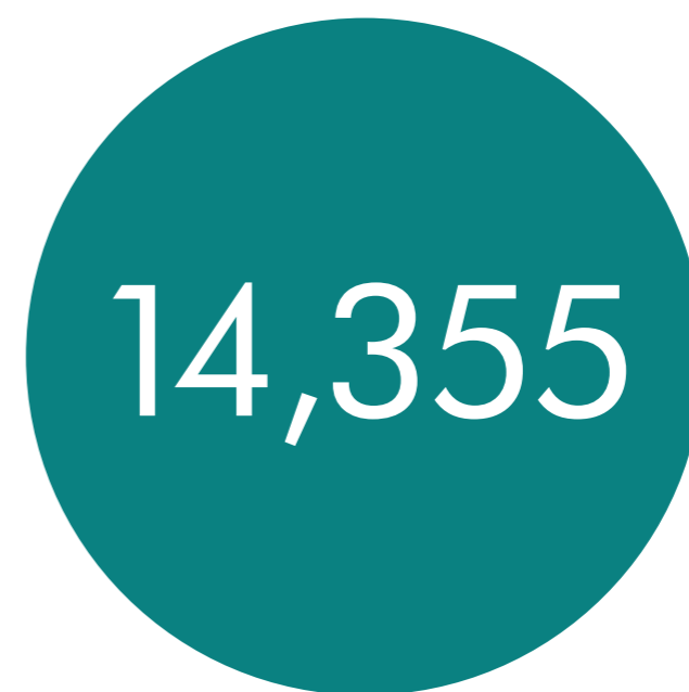
Complaints and enquiries received by IPSO in 2021

All enquiries are carefully assessed, and if any complaint might raise a potential breach of the Editors' Code, it is investigated fully