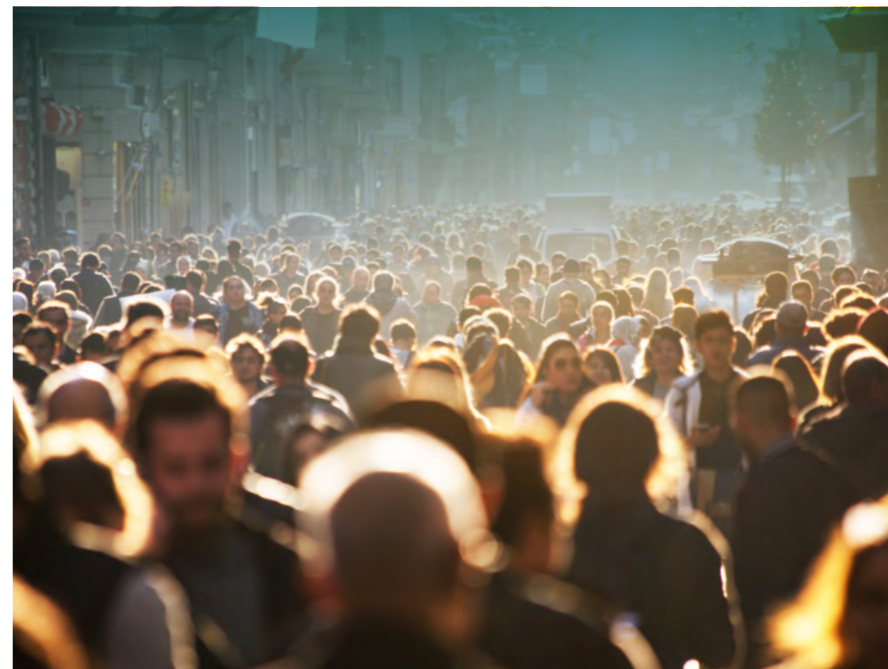
Everything we do ensures that editorial standards and public interests are aligned.